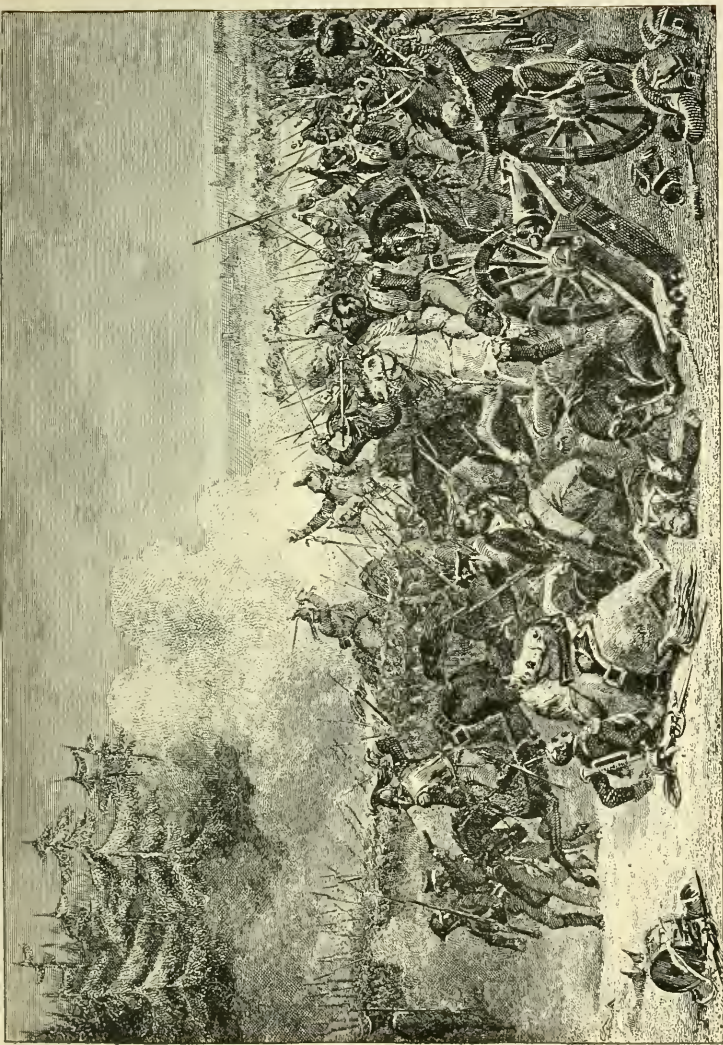
THE CHARGE OF THE CUIRASSIERS AT EYLAU